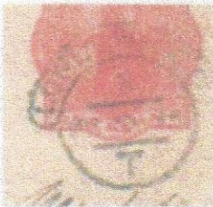
March 4, 1894 London

4 countries: Great Britain, Austria, Singapore, China 1894