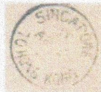
April 2, 1894 Singapore