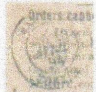
(back) April 10, 1894 Hanoi, Tonkin, China